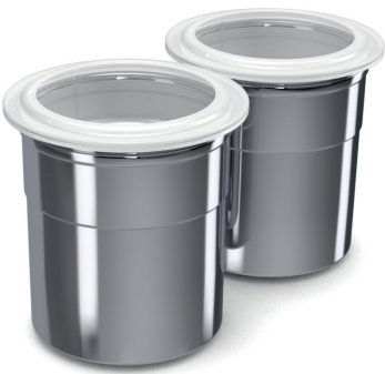
2 Chrome steel cups with sealing cap