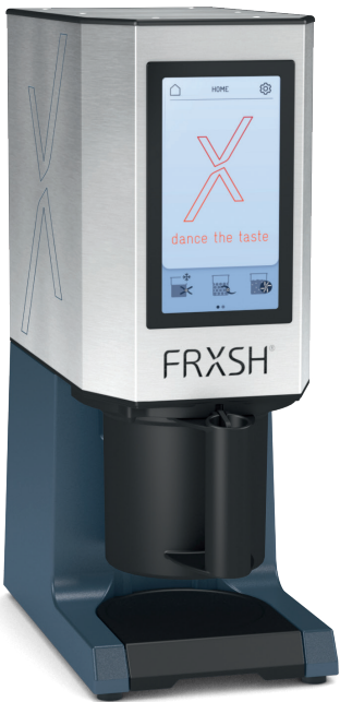
FRXSH Mousse Chef with protective beaker